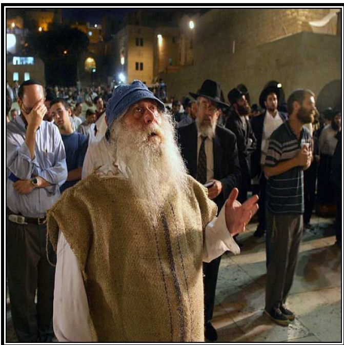
At the Kotel on Tisha B'Av

May our mourning this Tisha B'Av be tempered with some level of comfort, heeding Rabbi Akiva's powerful legacy of seeing the tragedies of Jewish history within the context of our collective destiny, and our march to that ultimate period of redemption, unity and joy, speedily and in our days... .K.